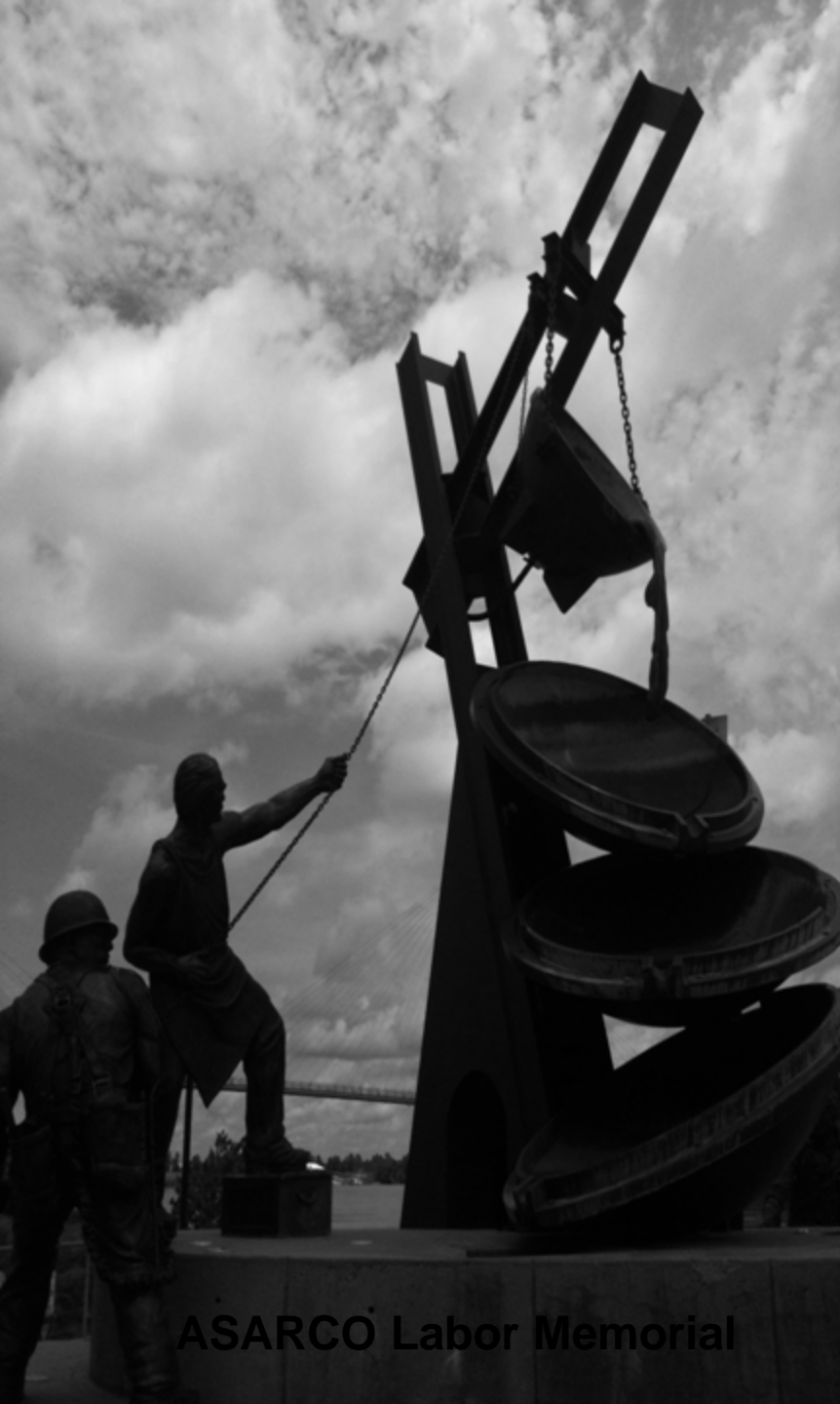
ASARCO Labor Memorial