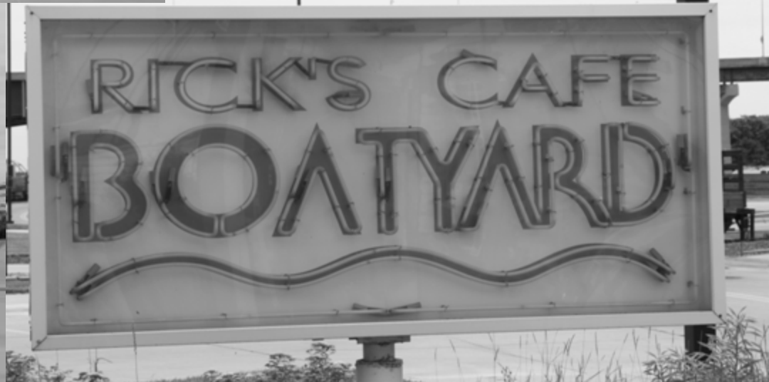
The Actual Site of the old ASARCO Plant Now a Destination Eating, Entertainment Venue