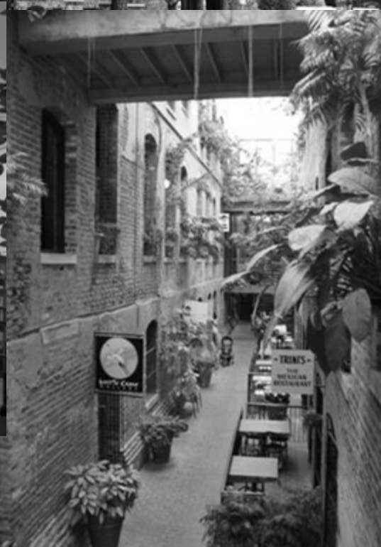
The Old Market District