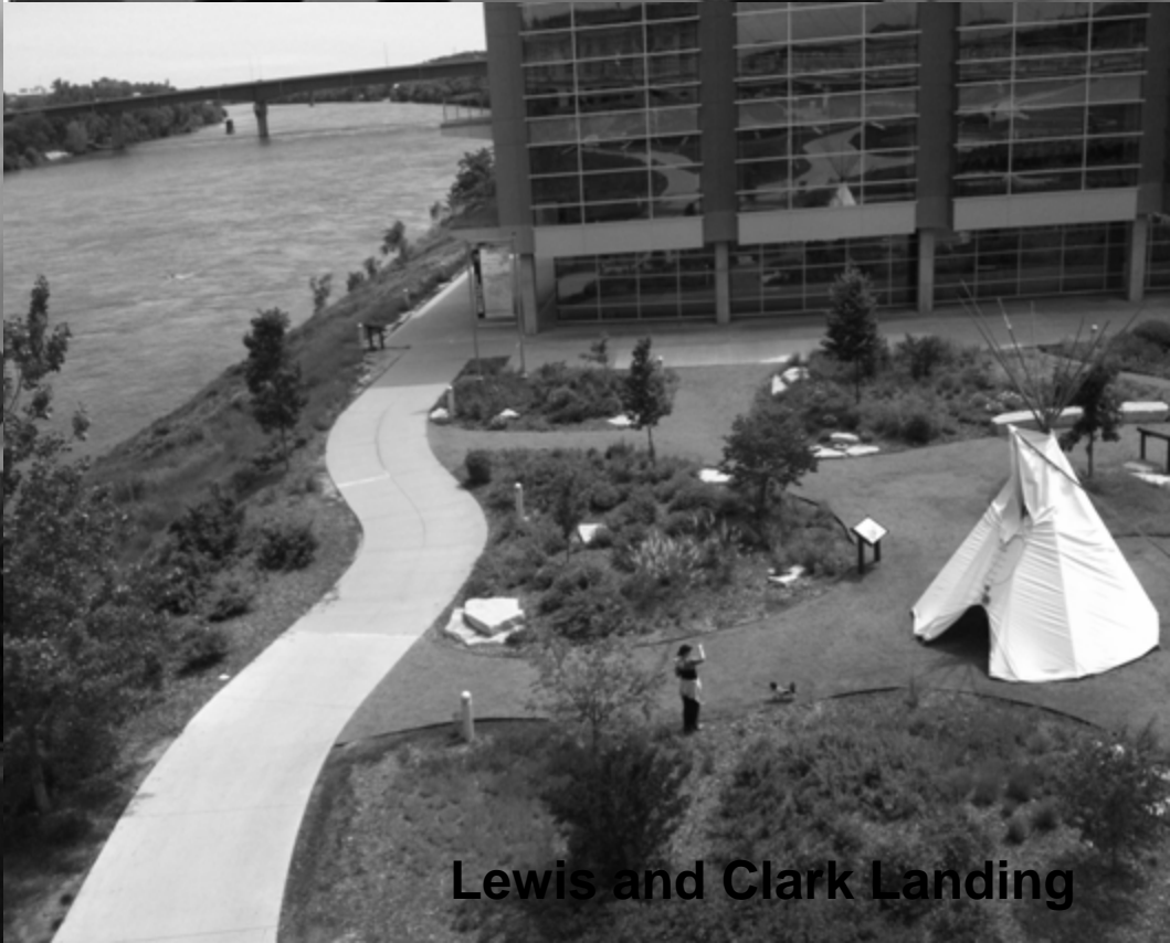
Lewis and Clark Landing