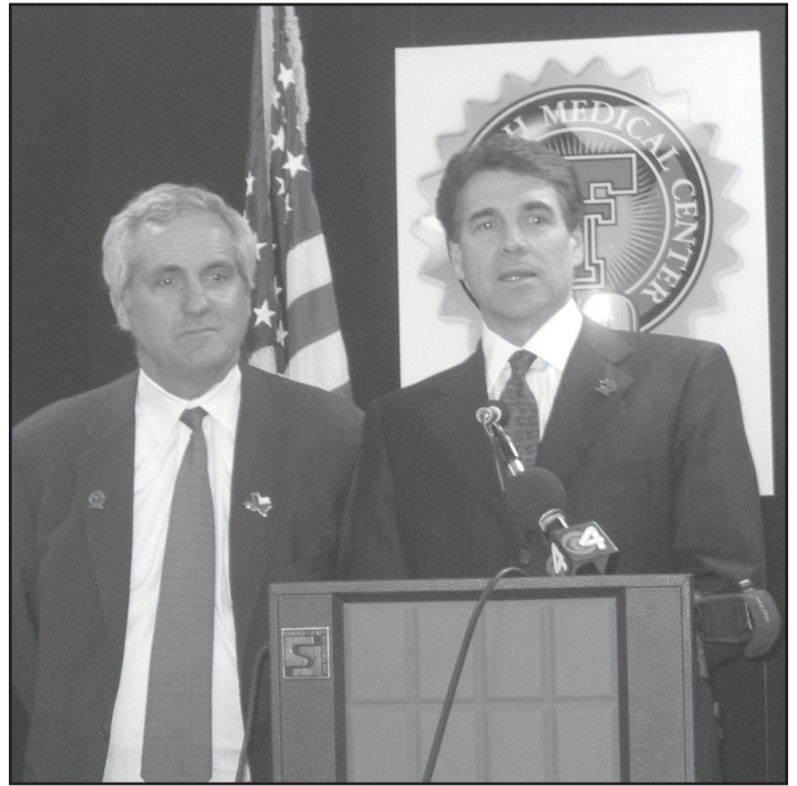
Senator Shapleigh and Governor Rick Perry announce the advancement of plans for El Paso's medical school.

Since being elected in 1996, we have been working to bring our great community a state of the art four-year medical school, and we are steps closer. In 2003, we received the legislative authority to expand the two-year Texas Tech medical school program to a four-year program. Since then, we have built buildings, collected private donations, and made plans for the next step. This past year, Governor Perry and Lt. Governor Dewhurst joined the cause and committed state monies to fund the school. $38 million was promised, and we are on the verge of making El Paso the Medical Center of the Americas .