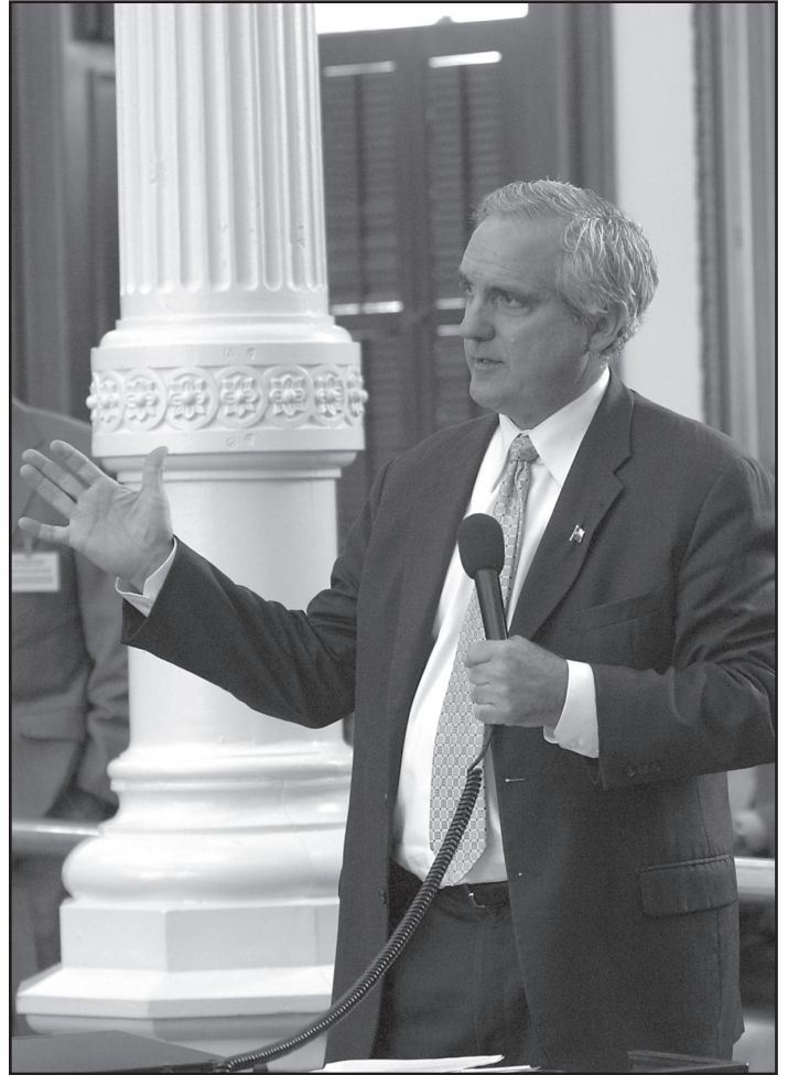
Senator Shapleigh debates the merits of a bill on the Senate Floor. The Texas Senate follows strict parliamentary rules where a Member must stand while speaking.