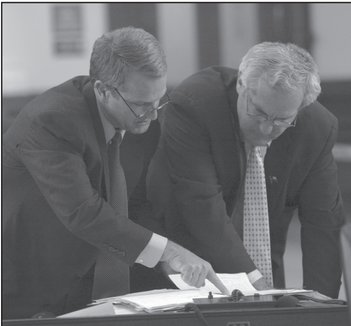
Senator Shapleigh and Senator Kyle Janek (R-Houston) pour over detailed language of a bill before a vote. Senator Shapleigh works with a Members of both parties in an effort to best represent the interests of El Paso and the Texas Border Region.